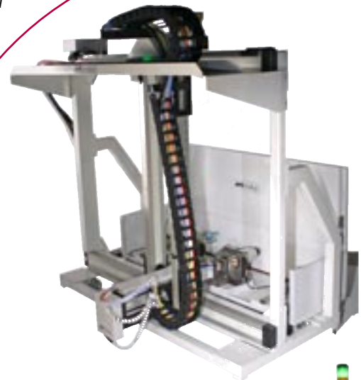
Artomation PanelPRO+ System and Touch Screen Controller

PanelPRO+ is manufactured and assembled with pride in the USA and comes with a 1 year warranty against defects in manufacture or workmanship.