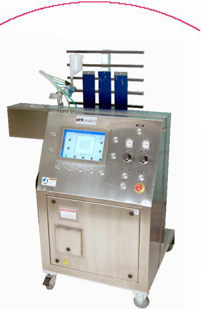
PanelPRO Jr. XL System

PanelPRO Jr. XL is manufactured and assembled with pride in the USA and comes with a 1 year warranty against defects in manufacture and workmanship.