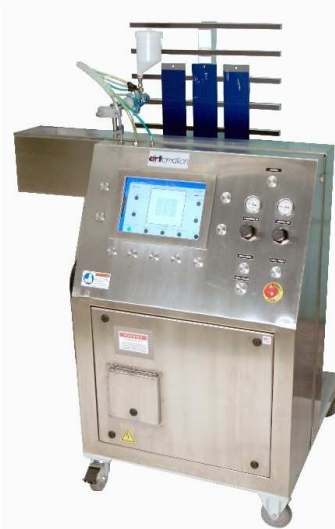
PanelPRO Jr. System

Each time a recipe is executed, usage statistics such as the time of day and recipe settings are recorded. The system automatically records this information to a standard USB drive and can be easily transferred to a standard PC. Recipes are automatically backed up to the USB drive weekly.